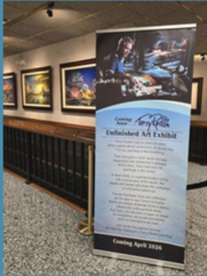
Unfinished Art Exhibit Terry Redlin Art Center Opens April 1, 2026