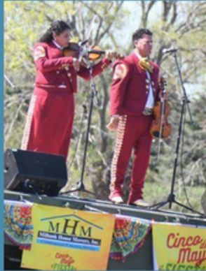
Cinco de Mayo Fiesta Lake Farley Park May 2, 2026