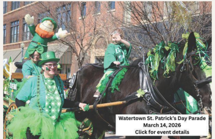
Watertown St. Patrick's Day Parade March 14, 2026 Click for event details